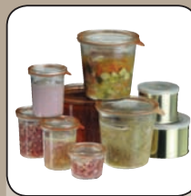
Sterilizing tinning goods