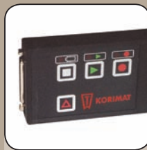
Data recorder for recording sterilization protocols