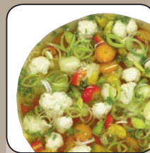
Quick boiling soups