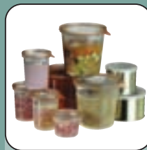
Sterilizing tinned goods