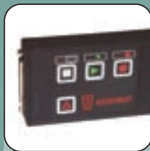
Data recorder for recording sterilization protocols